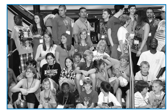
Some of our BTHS youth, young men, and siblings at BSF's 2010 conference.

Overall I found the conference to be a wonderful experience.