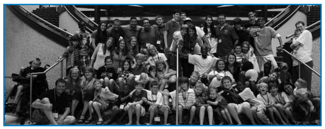
Group photo of Barth boys, young men and siblings at BSF's 2010 conference.