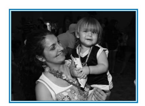
Candids of BTHS families at BSF's 2010 conference.