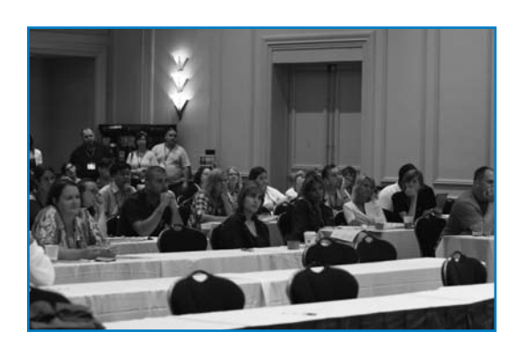
A Family session at BSF's 2010 conference.

To me, the Family sessions at BSF's 2010 conference exceeded this and more. There were nearly 50 affected families in attendance, 12 of whom were first-time conference attendees. Many had travelled great distances to meet with world-renowned experts in the field of BTHS to gain the most up-to-date information about treatments and research into this disorder.