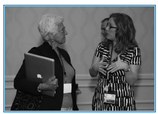
Candids taken at BSF's 2010 conference.

For all correspondence, including information, please contact: