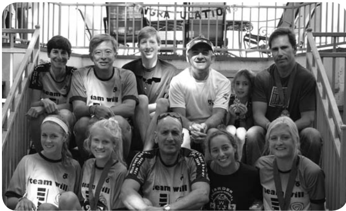
Team Will ... what an inspiring team!