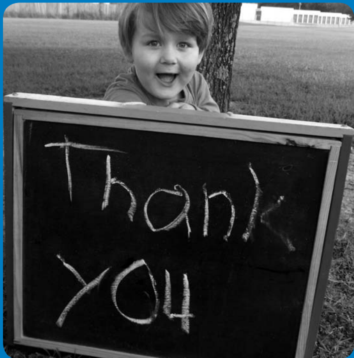
Christopher (age 5).