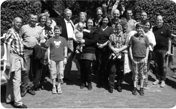
Dutch-speaking Family Gathering in The Netherlands.

Jo van Loo reports on a most enjoyable Family Gathering at the Zuiderzee Museum in Enkhuizen in The Netherlands on June 30, 2013. This indoor and outdoor museum is dedicated to the rich heritage of the area, focusing on themes of water, crafts and communities.