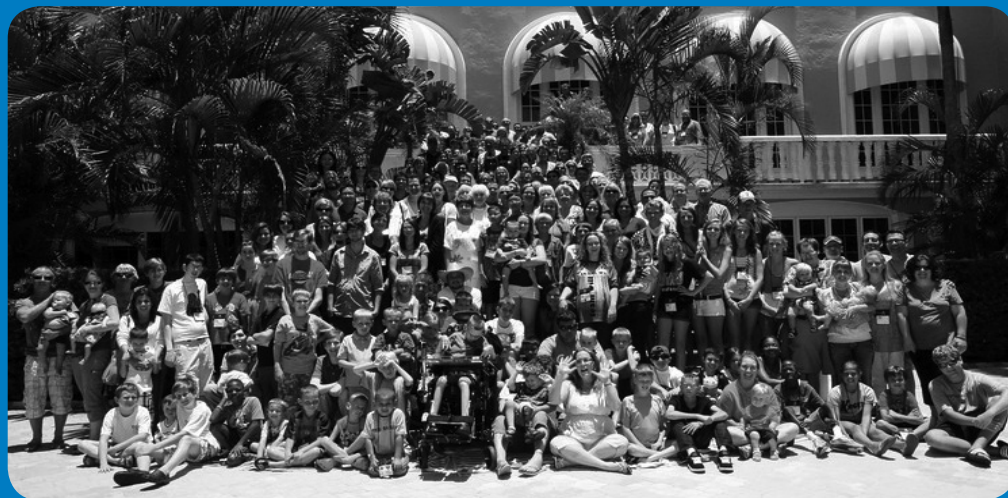
Families, physicians, and volunteers at BSF's 2012 Conference. Don't miss the opportunity to attend our 2014 Conference in Clearwater, Florida in June 2014!!!