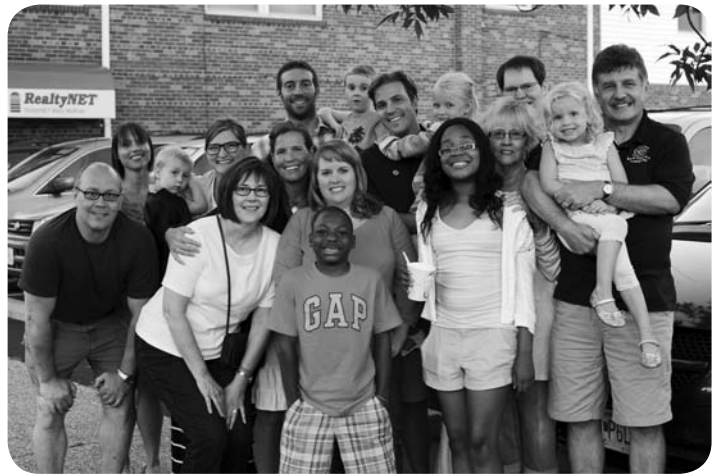
Families bonding at the St. Louis Outreach.

Sunday morning, we gathered one more time for breakfast, after which our sweet reunion was headed off to their respective homes. The weekend was a really special time for renewing old friendships, making new friendships, and enjoying a relaxed time of fun with our Barth families in the mid-west!