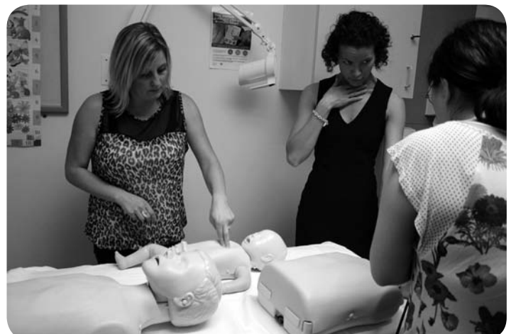
Mothers practise CPR skills.