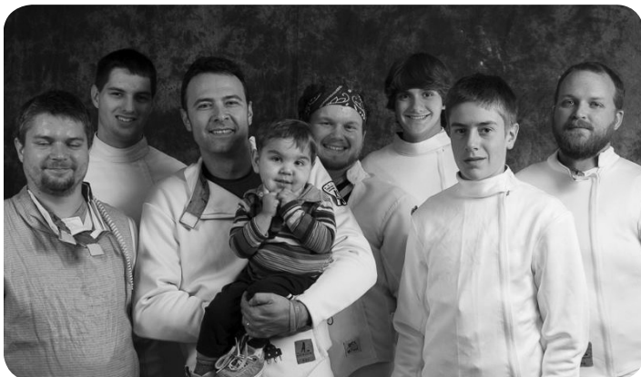
Blades Battling Barth Syndrome Open.