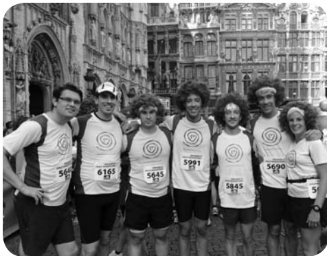
Barth France Team at the Bruxelles Half-Marathon.