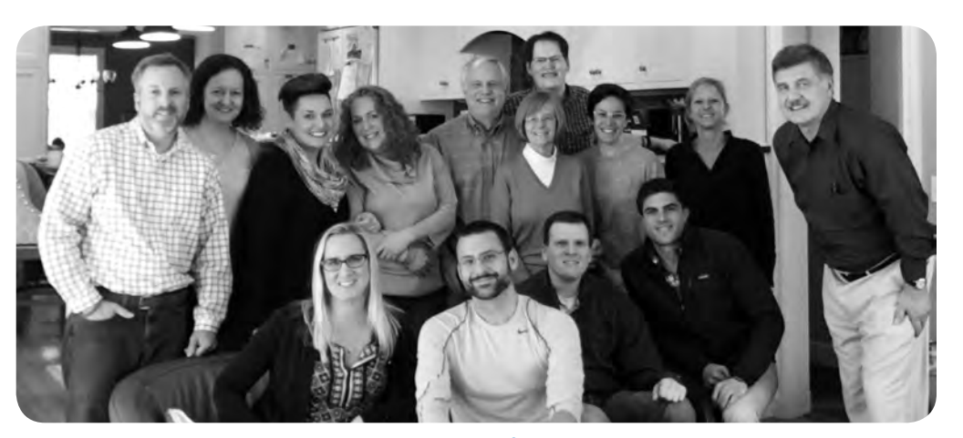
BSF board members and staff