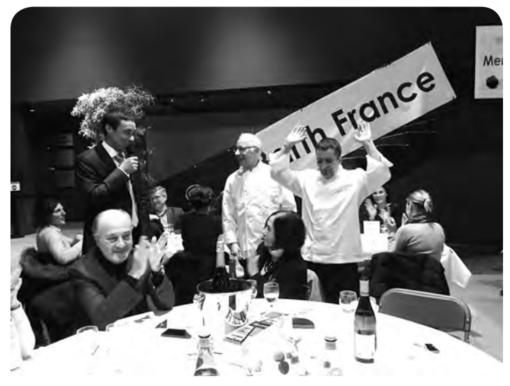
Just before the arrival of the 200 invitees to Barth France's 3<sup>rd</sup> Edition of the Black Truffle Charity Dinner