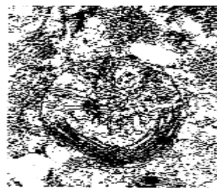
Electron microscopic photograph of mitochondria in the heart of a child with Barth syndrome. Notice the abnormal course of cristae.