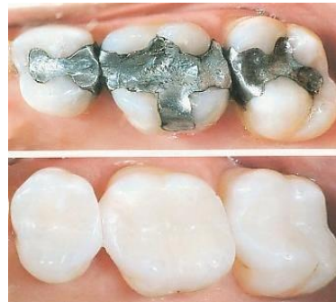
Top: Amalgam filling Bottom: Composite filling

Your dentist may have a "mercury-free practice" which eliminates any need for research on your part. If not, discuss this with the dentist to make an informed judgment about the material being used in the restoration. Opinions vary widely about the safe use of amalgam.